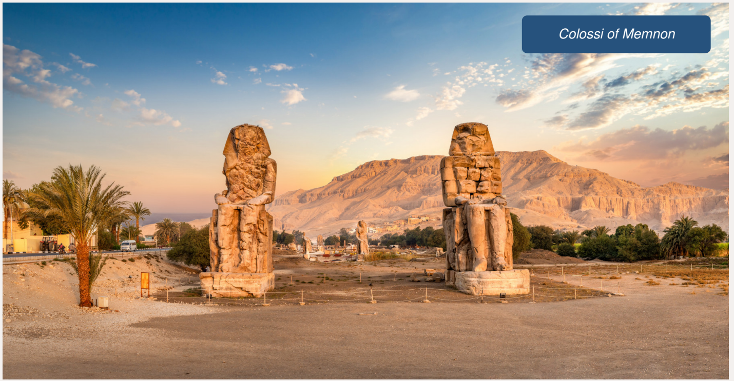
Colossi of Memnon